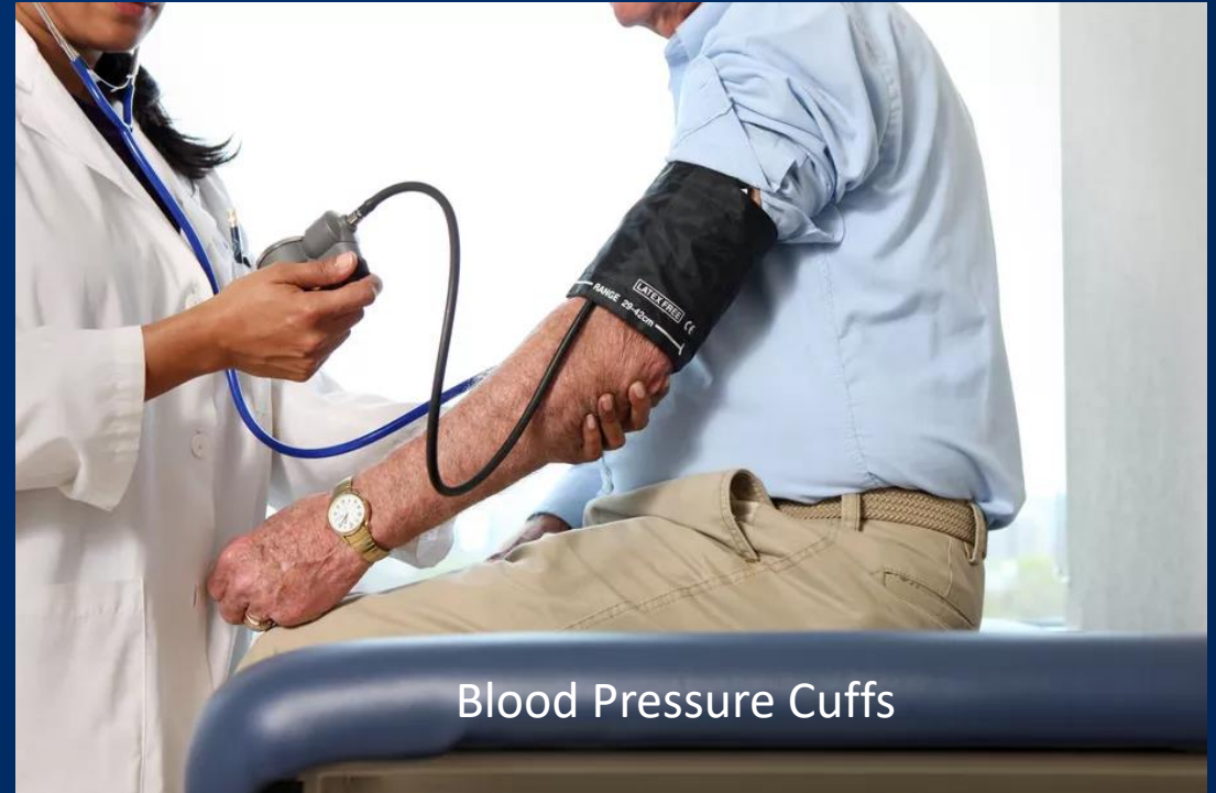
Blood Pressure Cuffs