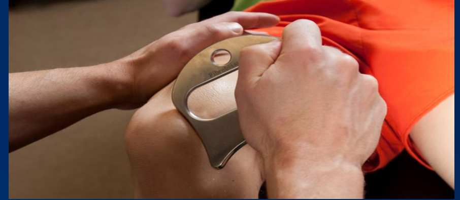
Manual Therapy Tools