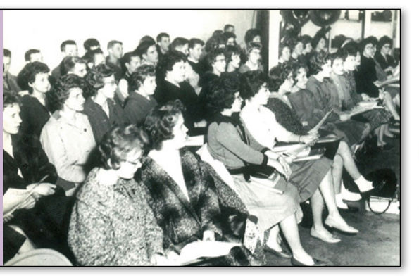
Choristers (chorus students) lived and breathed music for a solid two months as they prepared for the television appearance March 3, 1963, on the KOLN-TV program "College of the Air." Fairbury Junior College was the only junior college among 11 colleges to be selected for the honor.