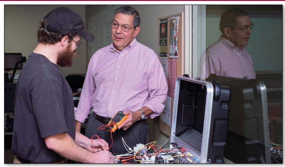
Program: Continuing Education