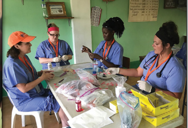
Preparing hygiene bags.