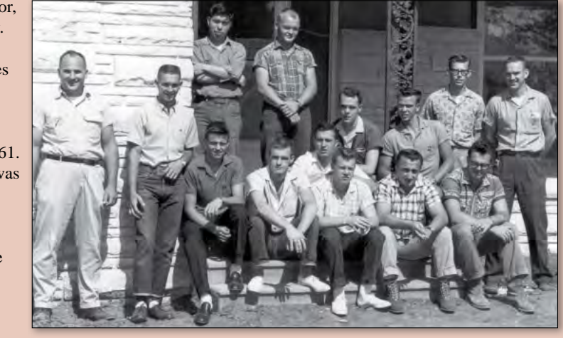
Featured Year – 1976