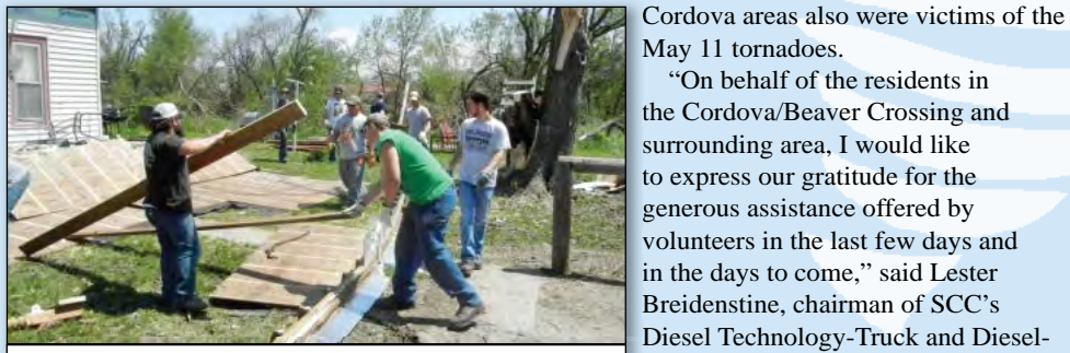
Precision Machining & Automation Technology students assist with clean-up in Beaver Crossing.

More than 700 volunteers were in Beaver Crossing the Saturday following the storm to help the community's 400 residents. Some SCC employees who live in the Beaver Crossing and