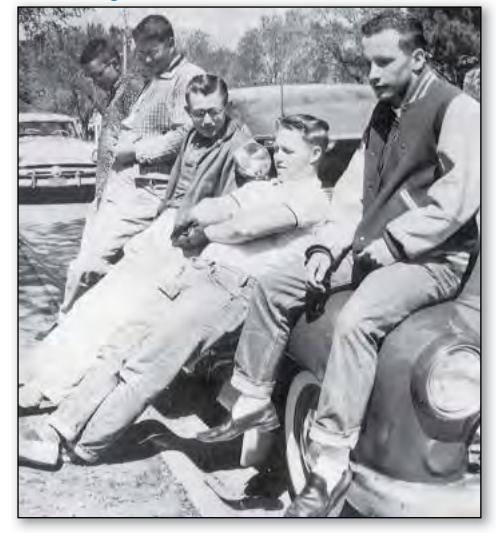
"Fairbury's college students loll in the sun. Spring fever, you know..."