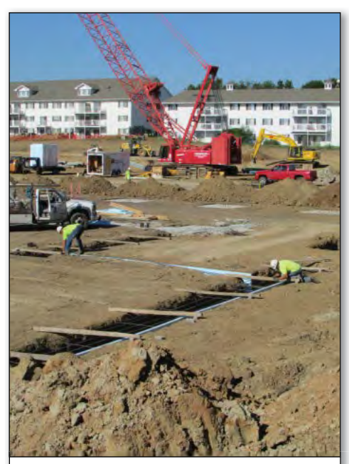
Lincoln Campus former south parking lot

Construction on the new $25 million Career Academy, a partnership between SCC and Lincoln Public Schools, continues to progress. This will be a two-story structure attached to the south side of the building. When you visit the Lincoln campus, you will be welcomed with additional parking on the east side. The contractors goal is to enclose the facility before inclement weather and we will continue to share the progress with you in upcoming newsletters. The Career Academy is scheduled to open in August 2015. For additional details on the academy, visit https://www.southeast.edu/ News_Stories/Groundbreaking_ceremony_ for_SCC-LPS_career_center/