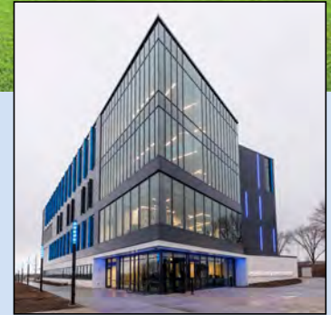
Sandhills Global Technology Center

Holding the distinction of being the oldest structure on the Milford Campus, the renovation project carefully balanced historic preservation with contemporary functionality. The transformed Nebraska Hall will create an environment where learning and campus life intersect, featuring consolidated administrative offices for streamlined student services, comprehensive academic support services, modern study and collaboration spaces, and a campus coffee shop.